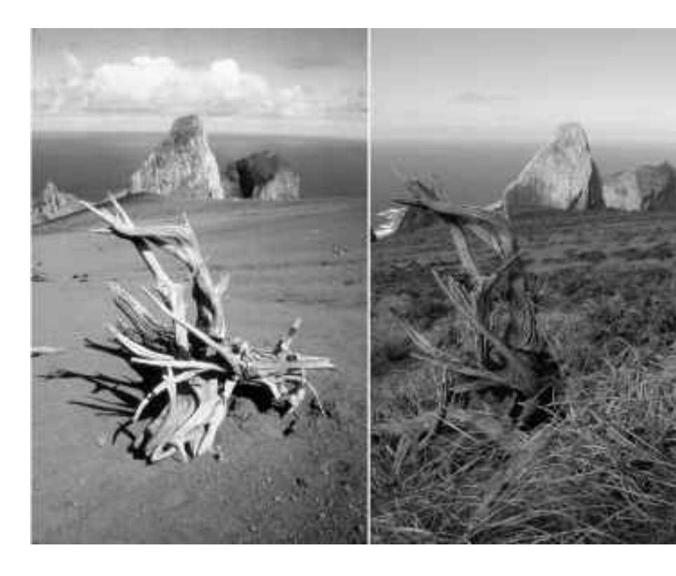
Fig. 2 A ridge on Trindade Island in 1995, hundreds of feral when goats degraded the vegetation and impeded recovery (left) and the same area in 2009, five years after feral goat eradication. The herbaceous layer is composed mainly of the two endemic sedges Cyperus atlanticus and Bulbostylis nesiotis. and widespread fern Pityrogramma calomelanos.

Areas kept barren by feral goats up to the 1990s are currently being colonised by herbaceous vegetation (Fig. 2). The chief pioneer species in this process are the endemic sedges Cyperus atlanticus and Bulbostylis nesiotis , followed by the fern Pityrogramma calomelanos (Alves and Martins 2004; Martins and Alves 2007).