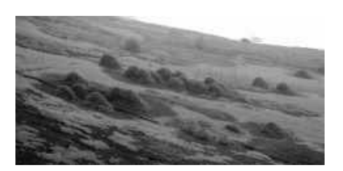
Fig. 3 Allelopathic halos of dead Cyperus atlanticus within the reach of root systems of the mistakenly introduced tree Syzygium cumini .

The beetle, Liagonum beckeri , is almost certainly the world's most extreme example of narrow endemism. The population is restricted to a wet rock of <1 m², inside a deep ravine. About 20 individuals of this beetle are visible