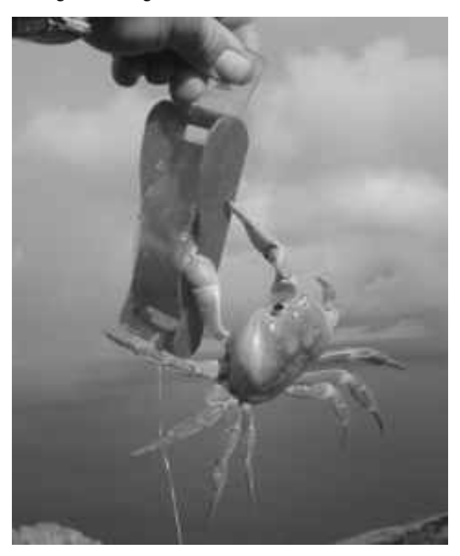
Fig. 4 The land crabs ( Gecarcinus lagostoma ) consumed most of the bait during preliminary field trapping in February 2010.

The only invasive vertebrate species now present on Trindade is the house mouse. The population is estimated to be in the order of hundreds of thousands of individuals. An assessment of their spatial distribution and seasonality on the island is being conducted. A detailed analysis of the house mouse's role in the Trindade food web is also pending. Preliminary observations indicate that mice consume most of the seeds produced on land, thus retarding vegetation recovery. They have been observed picking seeds of the endemic sedges Cyperus atlanticus, Bulbostylis nesiotis, and those of Colubrina glandulosa. The mice have also been seen foraging on eggs from seabird nests on the ground. Since the goat eradication was confirmed in 2004, and the island's vegetation shows clear signs of recovery, the invasive mice are the only significant setback to vegetation regeneration. Invasive rodents can also